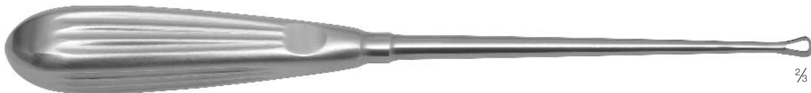
DISSECTING CURETTE DISSEKTIONSKÜRETTE 6 x 200 mm XSE-1