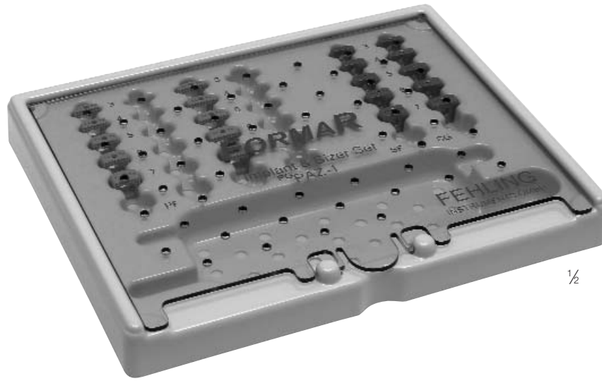
TRAY FOR CAGES, SIZERS + TOOLS BOX FÜR CAGES, SIZER + WERKZEUG